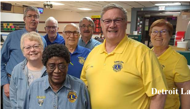
Detroit Lakes Lions

After being away from one of our favorite fundraisers for three years due to Covid and weather, the Detroit Lakes Lions were able to hold the Bowling Blast tournament again this year. We welcomed 15 teams to a fun afternoon of Midnight Bowling, Scotch Doubles and 8-Pin No Tap games. We gave our many door priz-