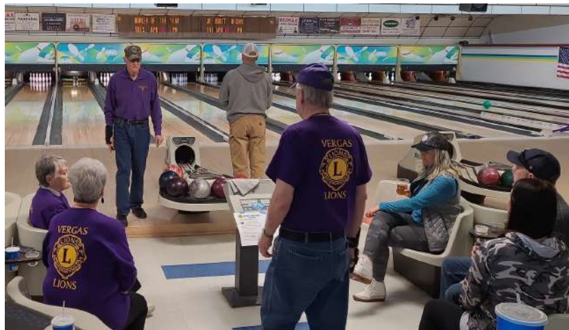
Vergas Lions team!